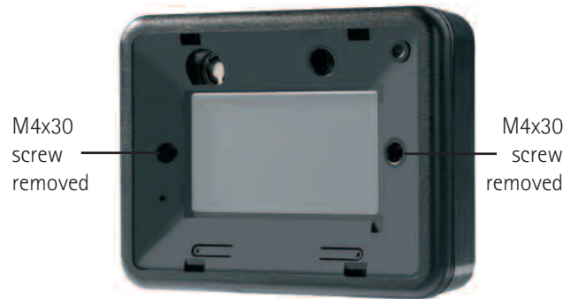
2-gang flush metal back box mounting